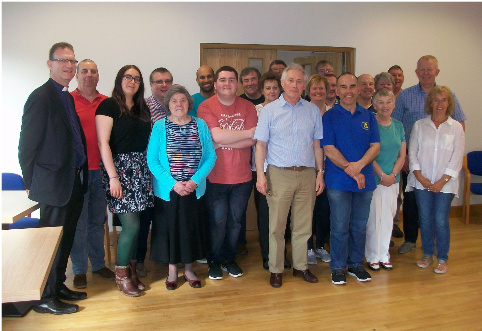
St Macartin's Cathedral Bell Ringers are pictured with the Dean and Ringers from other churches who joined them on Saturday 5th May at the district practice.

Join the campaign today by volunteering as a Bell Ringer. So that we can count you as one of the 1,400 Ringing Remembers ringers please contact any of St Macartin's Bell Ringers or the Cathedral Office.