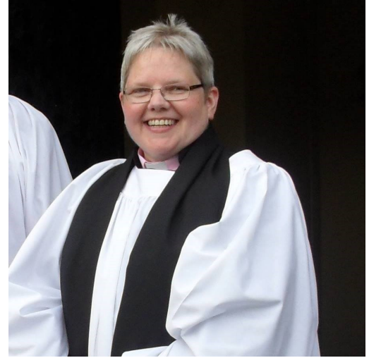
The old and new 'saints' of Clogher!